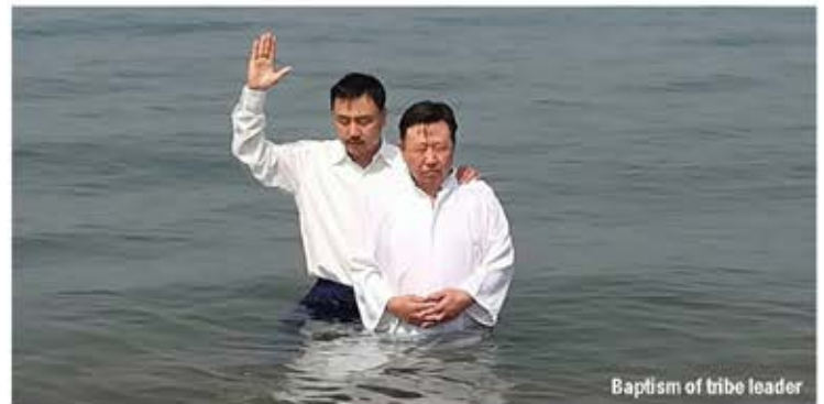
Baptism of tribe leader