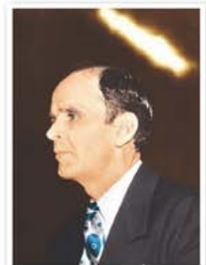
Behold I send you Elijah the Prophet