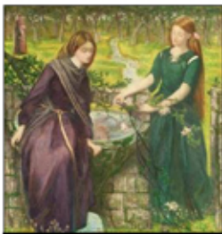
Leah & Rachel in the exchange of Dudayim

their relationship devolves into bitter envy, competition and jealousy. Then there is the mysterious “bargain” where Rachel trades Leah for a night out with Jacob, in exchange for Reuben’s “ dudayim ” - translated as mandrakes.