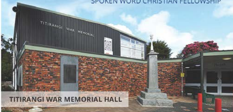
TITIRANGI WAR MEMORIAL HALL