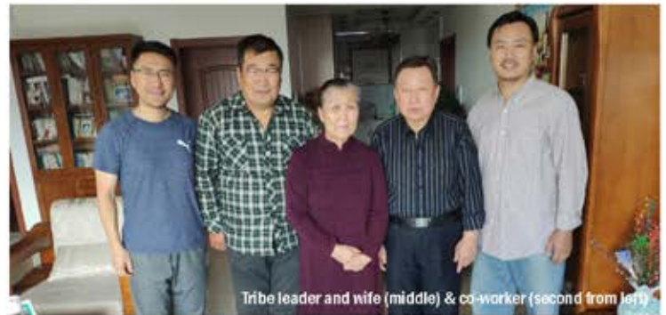
Tribe leader and wife (middle) & co-worker (second from left)