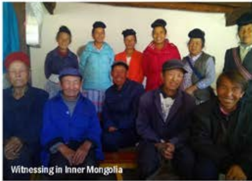
Witnessing in Inner Mongolia