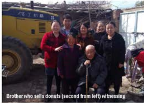
Brother who sells donuts (second from left) witnessing

This Brother also shared this Message to a Sister in Northern China, who in turn shared the Message to a house church leader in