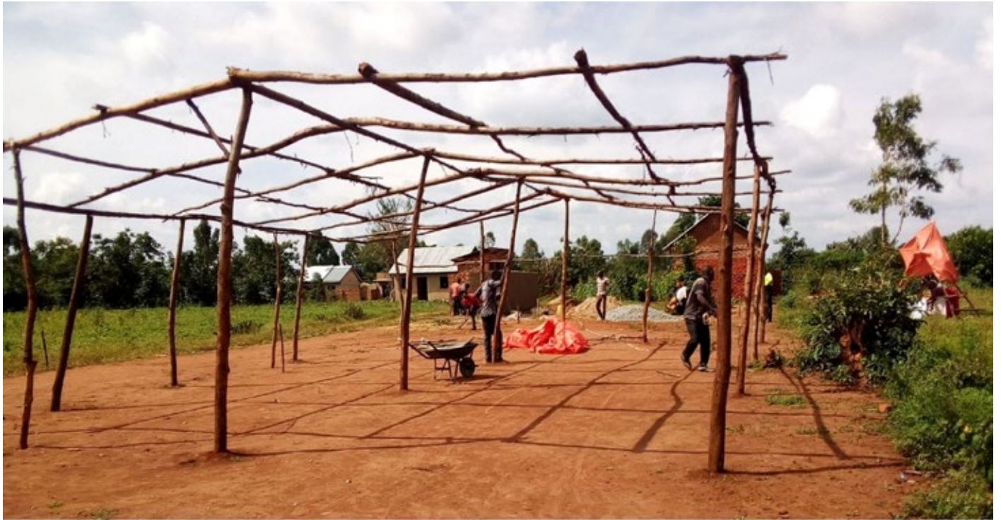
A Temporary Shelter in Nakalama, Uganda

However, the Kimaga experience provided valuable preparation in many ways, by providing a full walk-through of the construction process. A design was conceived, materials were priced, labor needs were evaluated, and qualified construction managers who could oversee the work were located. All of these resources are now in full use in the attempt to meet the exploding need.