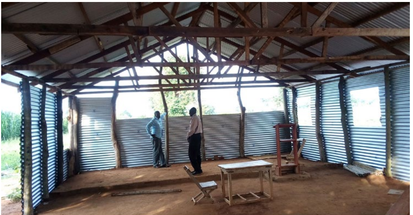
Interior of a tin building

With costs as little as $250 for basic shelter, almost anyone can be involved in helping to meet this urgent need. If you or your church would like to sponsor emergency shelter construction in Uganda, please contact Bible Believers. The need is immediate and funds will go to use right away.