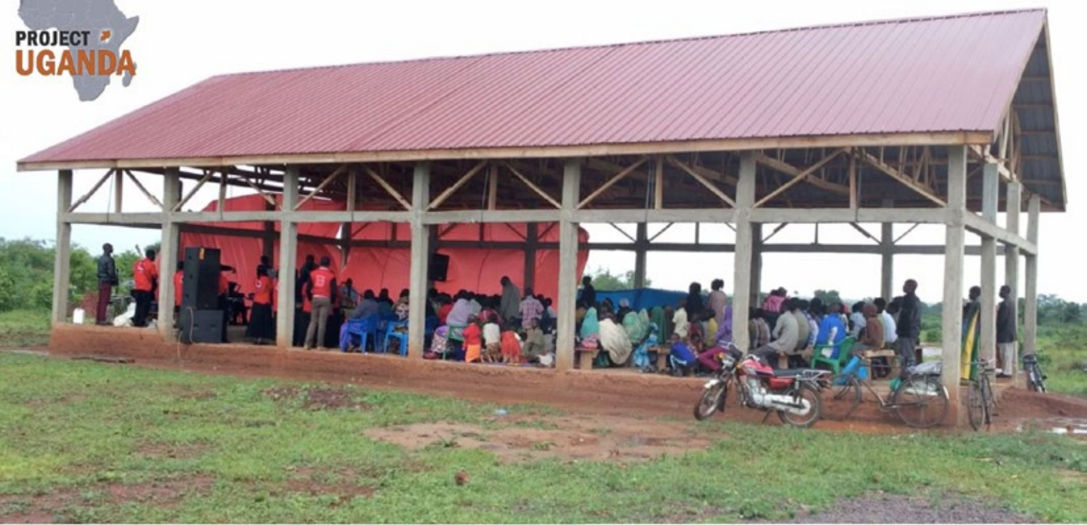
The Finished Church in Kimaga in use

With costs as little as $250 for basic shelter, almost anyone can be involved in helping to meet this urgent need. If you or your church would like to sponsor emergency shelter construction in Uganda, please contact Bible Believers. The need is immediate and funds will go to use right away.