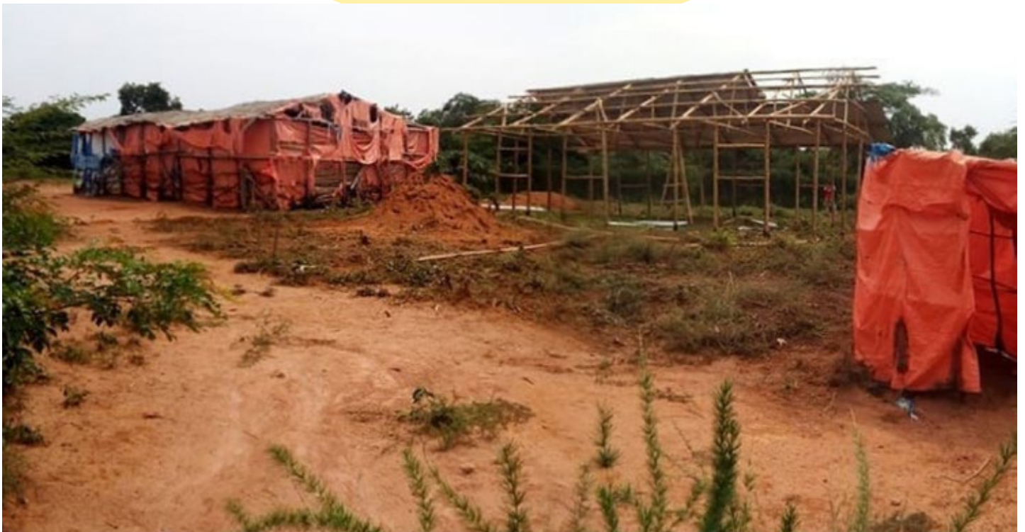
The church in Mygera upgrades to a tin building