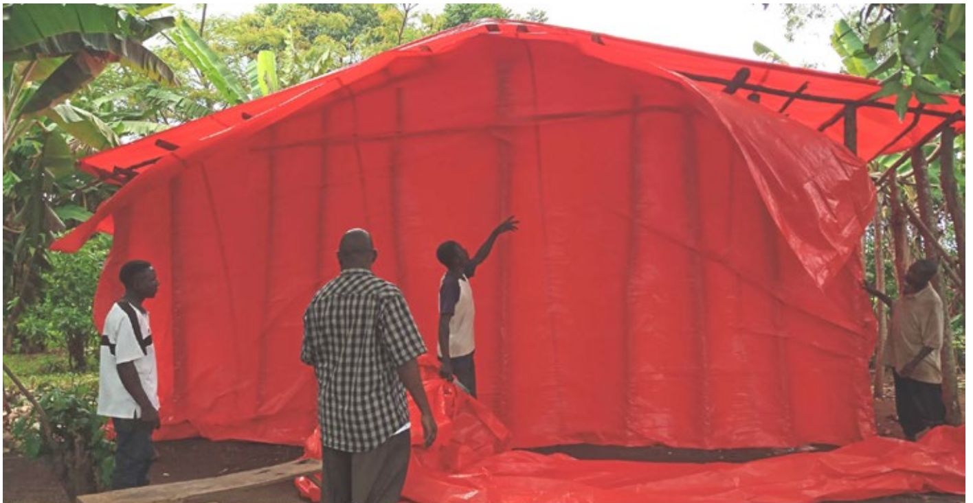
Brother Fred Kiyingi (nearest) observes a temporary shelter in progress