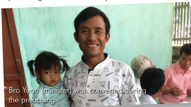
Bro Yuan (minister) was converted during the preaching