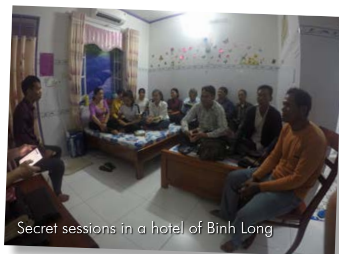
Secret sessions in a hotel of Binh Long

This trip saw new groups hearing the Message for the first time and church groups were moved by the preaching of the Word. Many doors were