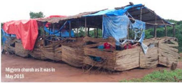
Migyera church as it was in May 2018