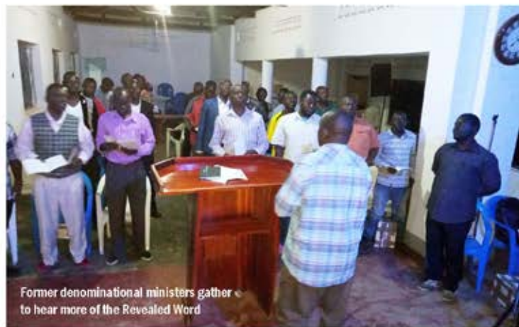
Former denominational ministers gather to hear more of the Revealed Word

Baptist ministers were also listening to the broadcast. Since that May visit, the revival has broken into new areas, with over 25 Baptist pastors re-baptized following a meeting in July. The initial revival had sparked among Pentecostals, but the radio broadcast continues to have an impact, gaining an audience among groups that would never visit a Pentecostal church. After listening to the Word in the safety of privacy,