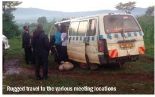
Rugged travel to the various meeting locations