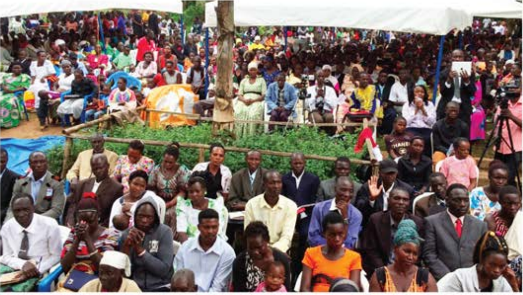
A portion of the gathering of over 2000 new Believers in Kampala in May 2018