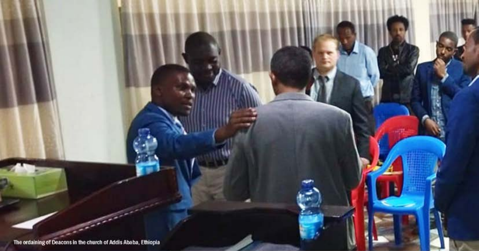
The ordaining of Deacons in the church of Addis Ababa, Ethiopia