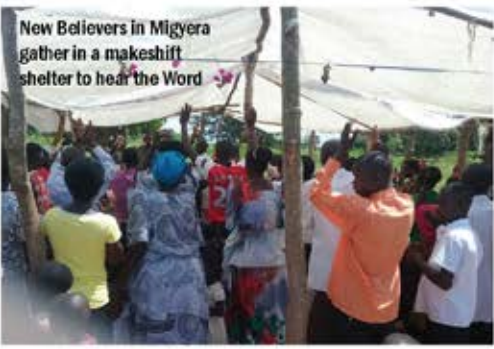
New Believers in Migyera gather in a makeshift shelter to hear the Word