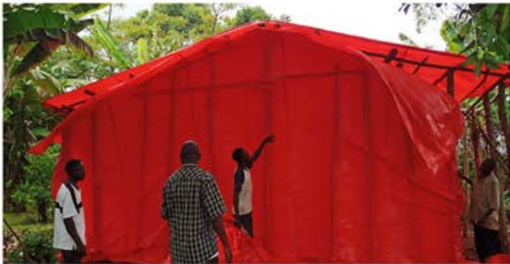
Above: Another church shelter provided for the new Believers. Below: Newly completed church structure for the congregation in Kimaga.