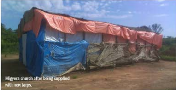
Migyera church after being supplied with new tarps.