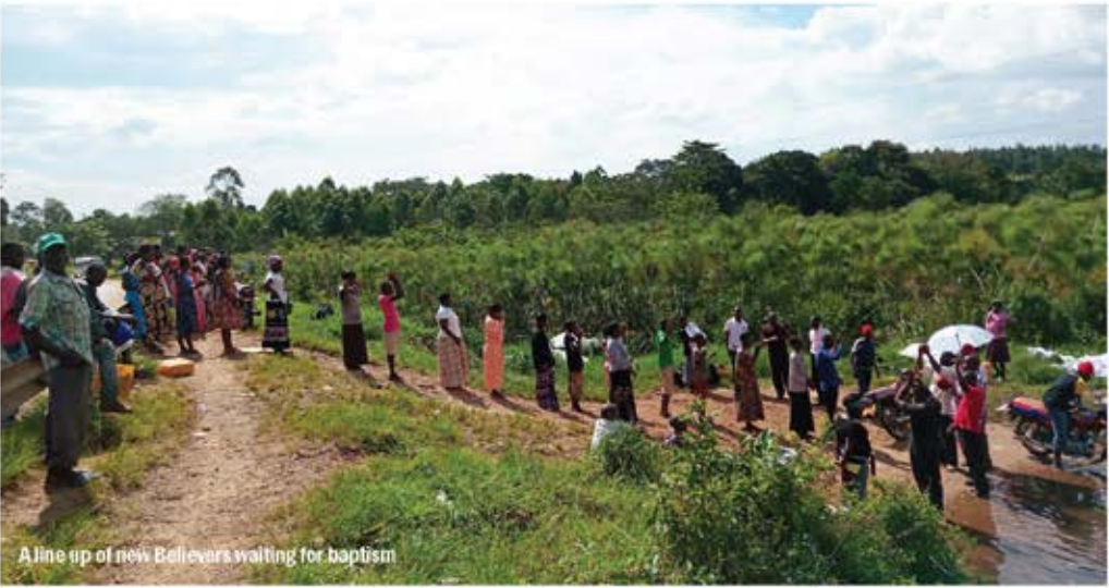
A line up of new Believers waiting for baptism

Then Brother Fred visited a group that had gathered in Migyera, some 20 miles away. These also had raised a makeshift shelter. Another 35 were baptized there! Eventually about 140 souls from these two groups were baptized.