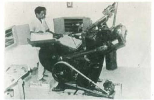
YES, IT'S NEW & MODERN BY INDIA'S PRINTING STANDARDS. INSTALLED IN MAY 1981 AT RAJAMUNDY.