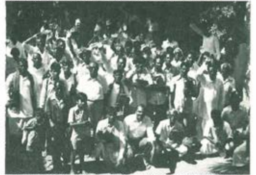
MINISTERS GATHERED AT NOV. '80 CONVENTION IN RAJAMUNDY TO HEAR AND BE TAUGHT IN THE MESSAGE.

OVER 40 MESSAGES HAVE NOW BEEN TRANSLATED INTO THE TELUGU LANGUAGE! — PRAISE GOD!