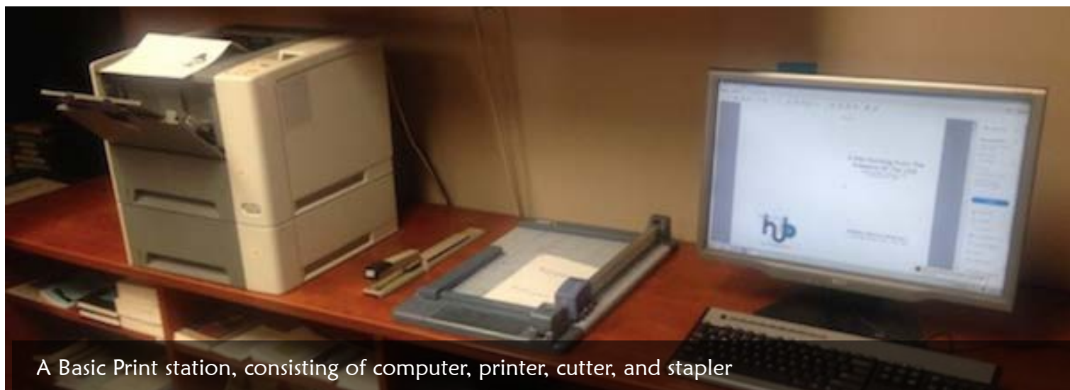
A Basic Print station, consisting of computer, printer, cutter, and stapler