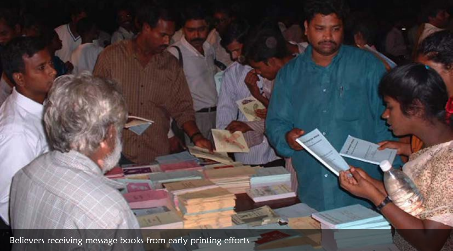
Believers receiving message books from early printing efforts

But the advent of the internet was destined to bring a fundamental change to how the Message of the Hour could be disseminated, both in India, and around the world today. The original printing equipment was aging and becoming inefficient. Translators worked tirelessly to produce hundreds of messages in native Indian languages, but a bottleneck was developing around printing and distribution.