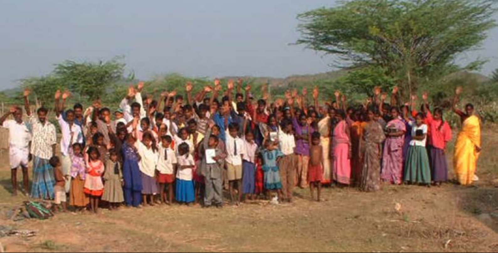
Believers from early outreach effort

The William Branham Good News Charitable Society, now up and running, operates from a small office in the city of Virar, near Mumbai, and using the Message Hub as its online inventory, is able to respond quickly to any request. This is the milestone that has passed, for the new office was officially opened on August 3rd, 2019. The city of Virar was chosen, for the new office, for its advantages in cost of operations.