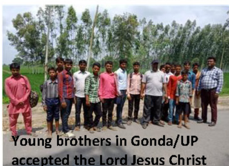
Young brothers in Gonda/UP accepted the Lord Jesus Christ

Though India's Constitution guarantees religious freedom for all citizens, the government needs to protect those freedoms or persecutions will likely continue. India's elected Prime Minister, Narendra Modi, captured the sentiment of this radical movement when he asserted that Hinduism is "not a religion, but a way of life." To be Indian, the argument goes, is to be Hindu. The large capital city of the state of Uttar Pradesh—and the churches they have planted face increasing persecution. Other churches and even Muslim groups also fall prey to the more violent expressions of Hindu nationalism.