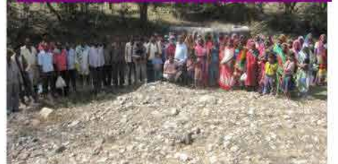
All the believers who got baptized

Rajasthan is a vast desert region of 68.5 million people who are thirsty for the Gospel. Christians are a tiny minority of just 0.1%, and are mostly within the Dalit (Untouchable) and tribal groups. Nearly 89% of people are Hindu.