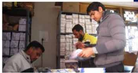
Packing books for distribution

are pretty sure this Message book will be a great blessing to the Bride of Christ in India/Punjab.