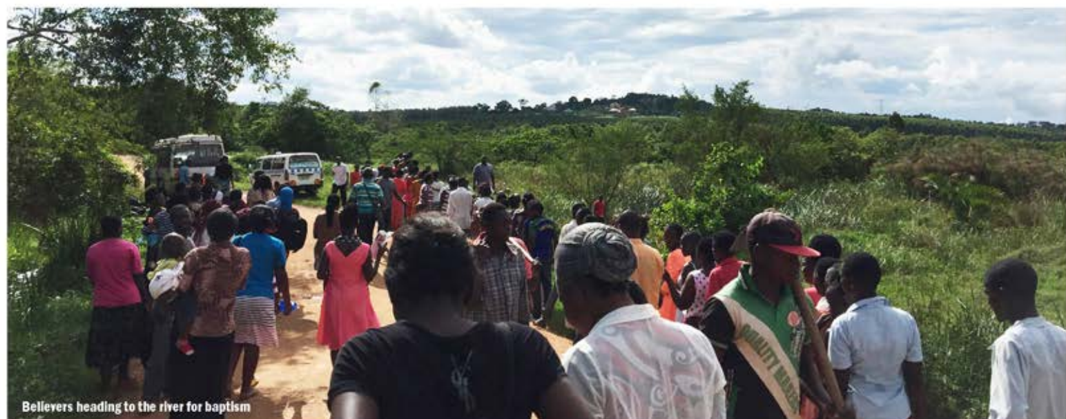
Believers heading to the river for baptism

Bible Believers is committed to assisting the Brethren in Uganda and covets your continued prayer and support.