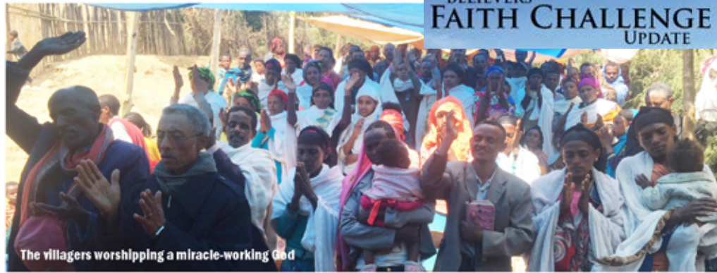
The villagers worshipping a miracle-working God

W e serve a God who bears witness of Himself, by His supernatural acts.