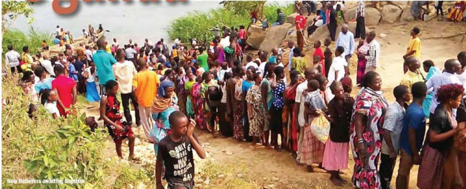
New Believers awaiting baptism

"And ye shall know the truth, and the truth shall make you free." John 8:32