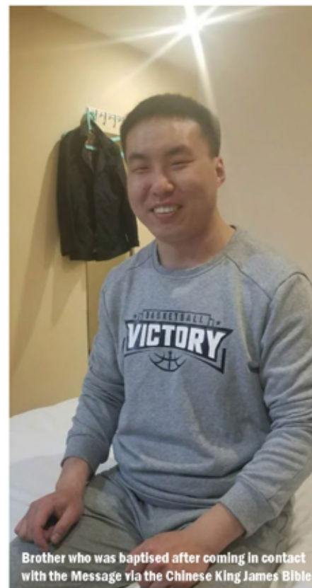
Brother who was baptised after coming in contact with the Message via the Chinese King James Bible