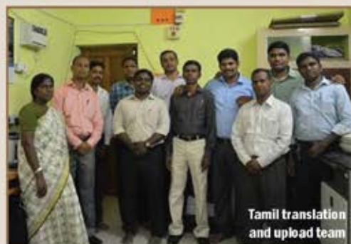
Tamil translation and upload team