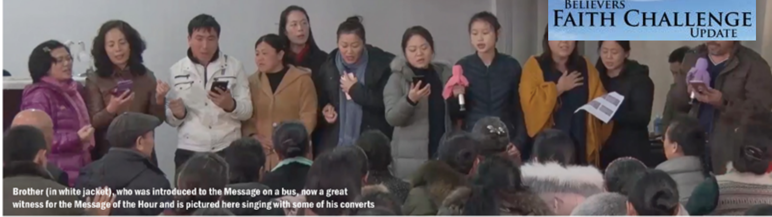
Brother (in white jacket), who was introduced to the Message on a bus, now a great witness for the Message of the Hour and is pictured here singing with some of his converts