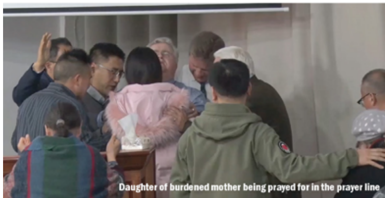
Daughter of burdened mother being prayed for in the prayer line