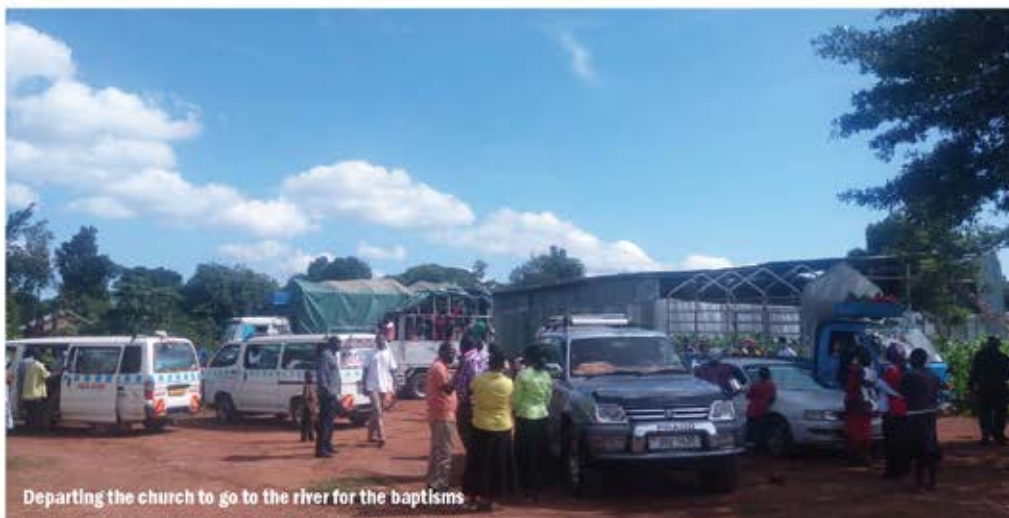
Departing the church to go to the river for the baptisms