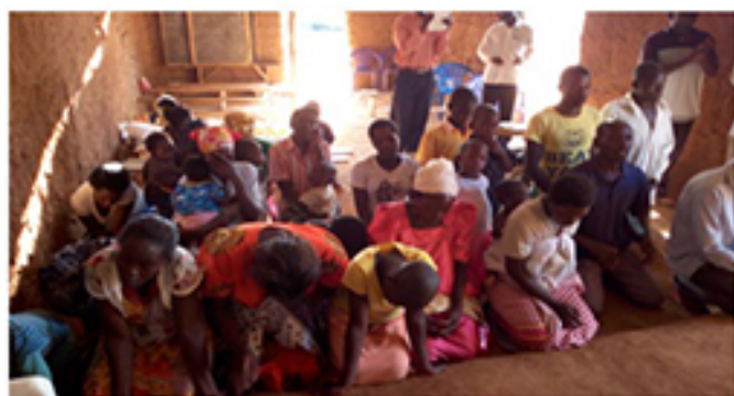
Alter call at Marindi Church on Tuesday 18th April

In Yibwe so many people came in the prayer line. Among them was a little girl who had demons and the mother had tried all the witch doctors. She had also tried faith healers who only took money but nothing happened. She brought her to us and we cast out the demons. Another man whose legs were swollen such that he could hardly move came in the prayer line and a few minutes before we left to Marindi where we were staying he was seen carrying a very heavy luggage, running to catch the boat.