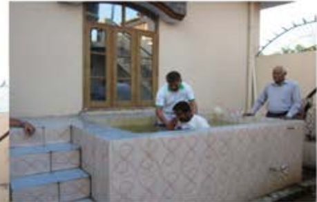
Song Leader & Deacon

It is all about expanding the GLORY OF GOD among the unreached peoples of the earth "Let's not forget that the return of Christ is tied to every nation hearing the good news. Thanks for your generous support in the Ministry. God bless you abundantly.