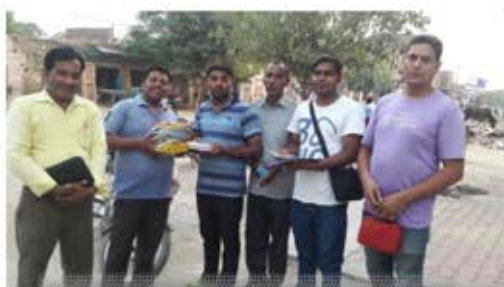
Providing Message Material