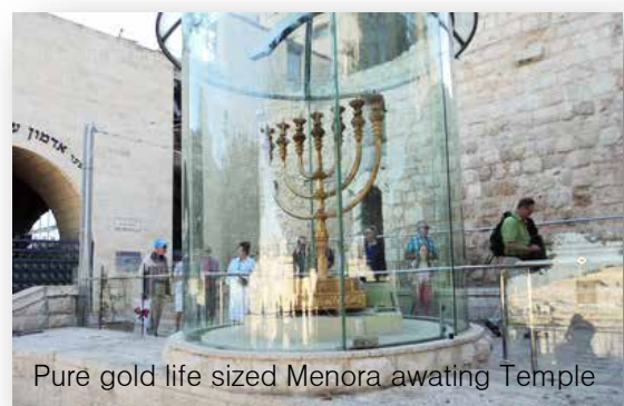
Pure gold life sized Menora awaiting Temple