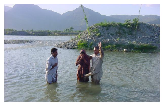
Water baptism at Batkhela