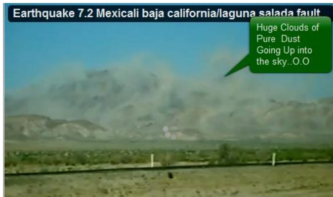
Taken from the highway 30 kilometres south of Mexicali.

In the You Tube still extracted at right clouds of dust rise into the clear blue sky as the mountains shake in the recent Easter Sunday 7.2 magnitude earthquake in California and Mexico.