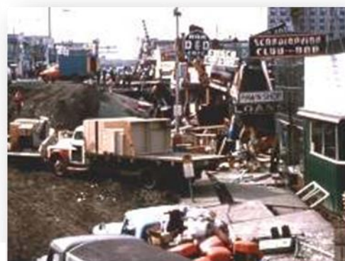
Road subsidence Shopping Centre Alaska

Interestingly Brother Branham's messages preached throughout April 1964 were to do with a pretended Court trial where God was being indicted for breach of promise, while all the time it was the world's prosecutors that