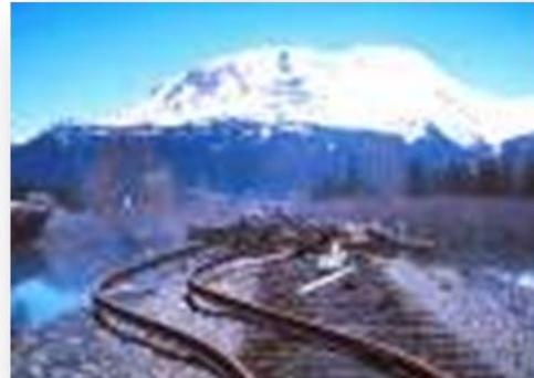
Railway line damage -Alaska

God, have mercy, Jesus Christ the same yesterday, today, and forever.